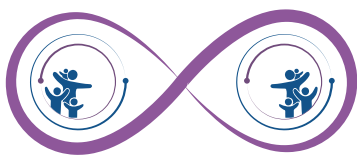
Family to Family

The following three key connection areas will guide Village's efforts: