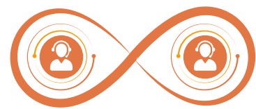
Services to Services